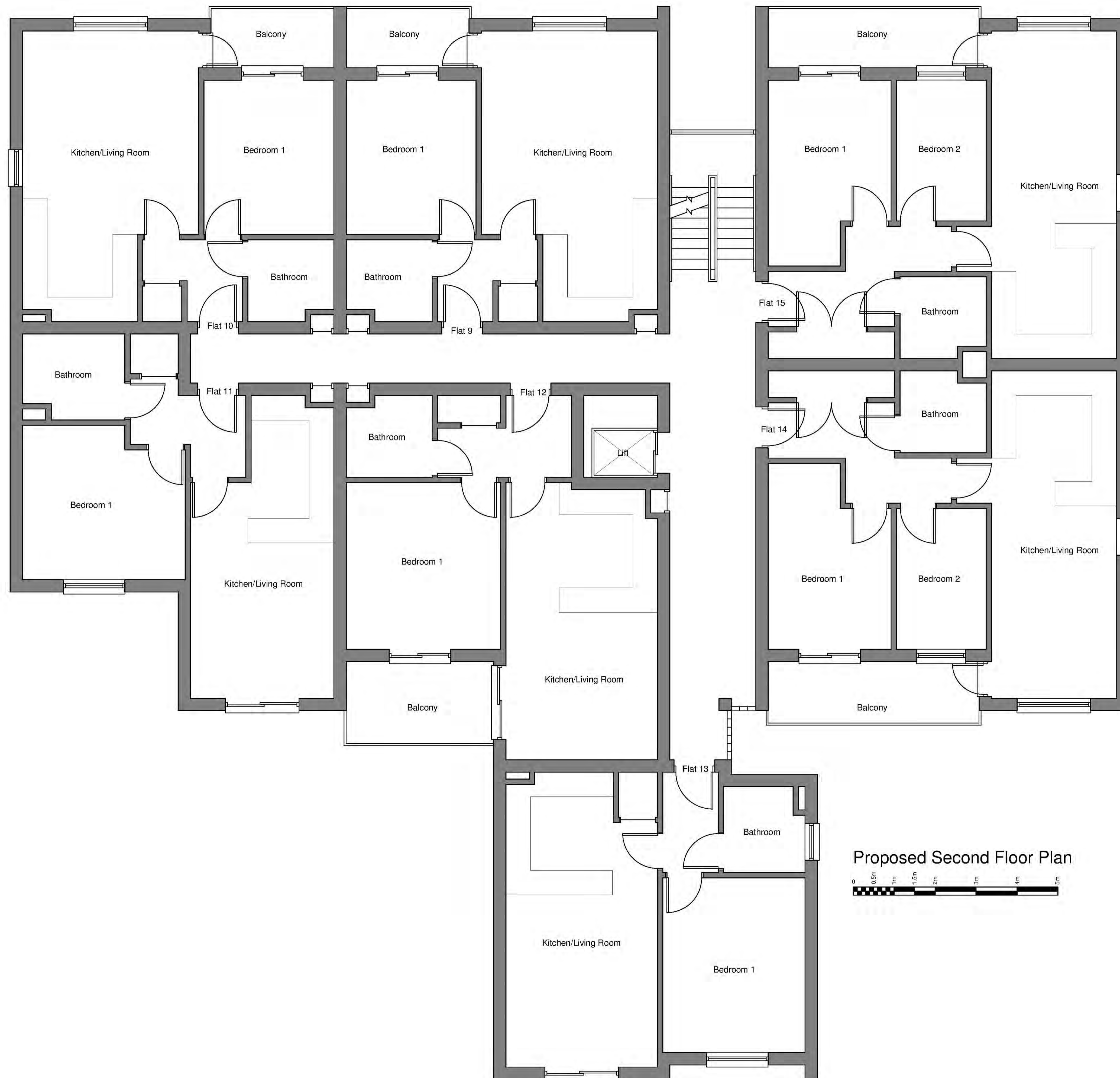
Proposed Second Floor Plan